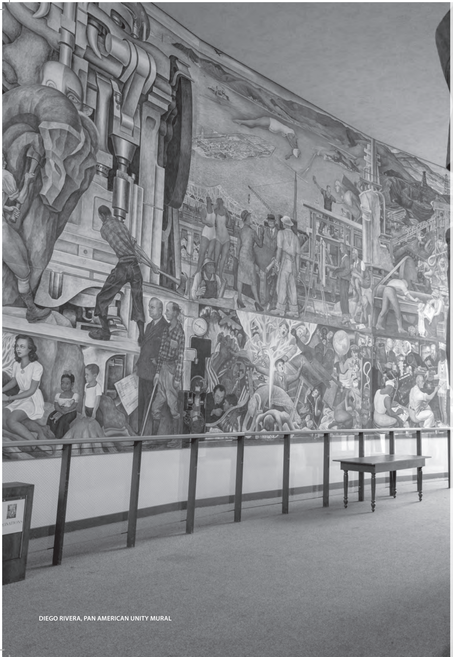
DIEGO RIVERA, PAN AMERICAN UNITY MURAL