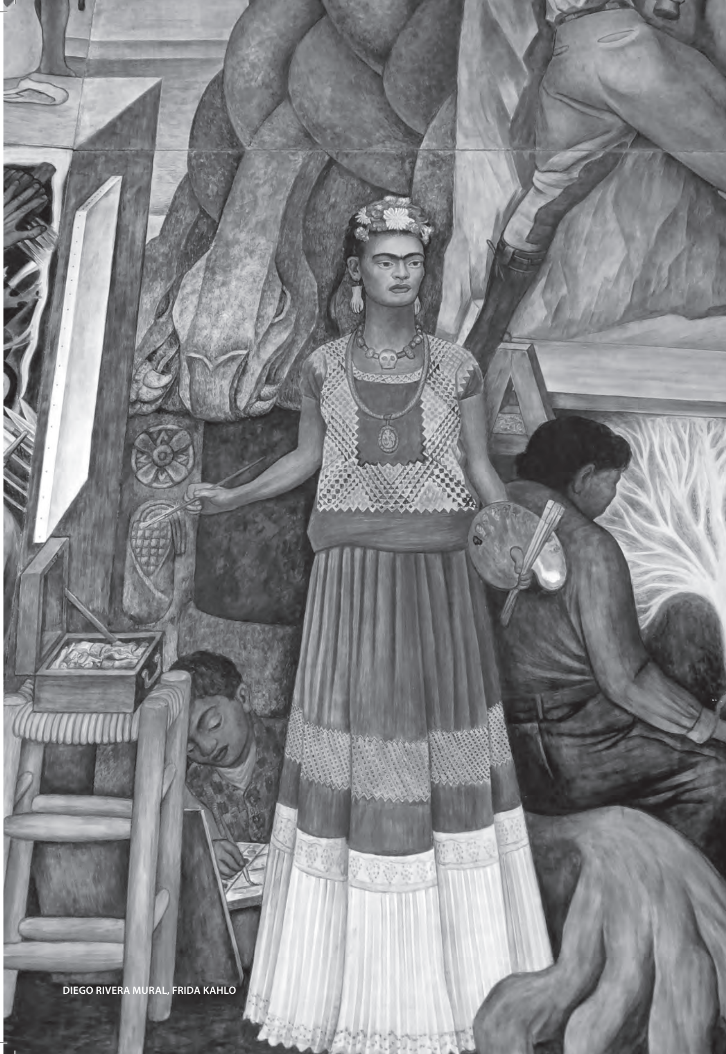
DIEGO RIVERA MURAL, FRIDA KAHLO