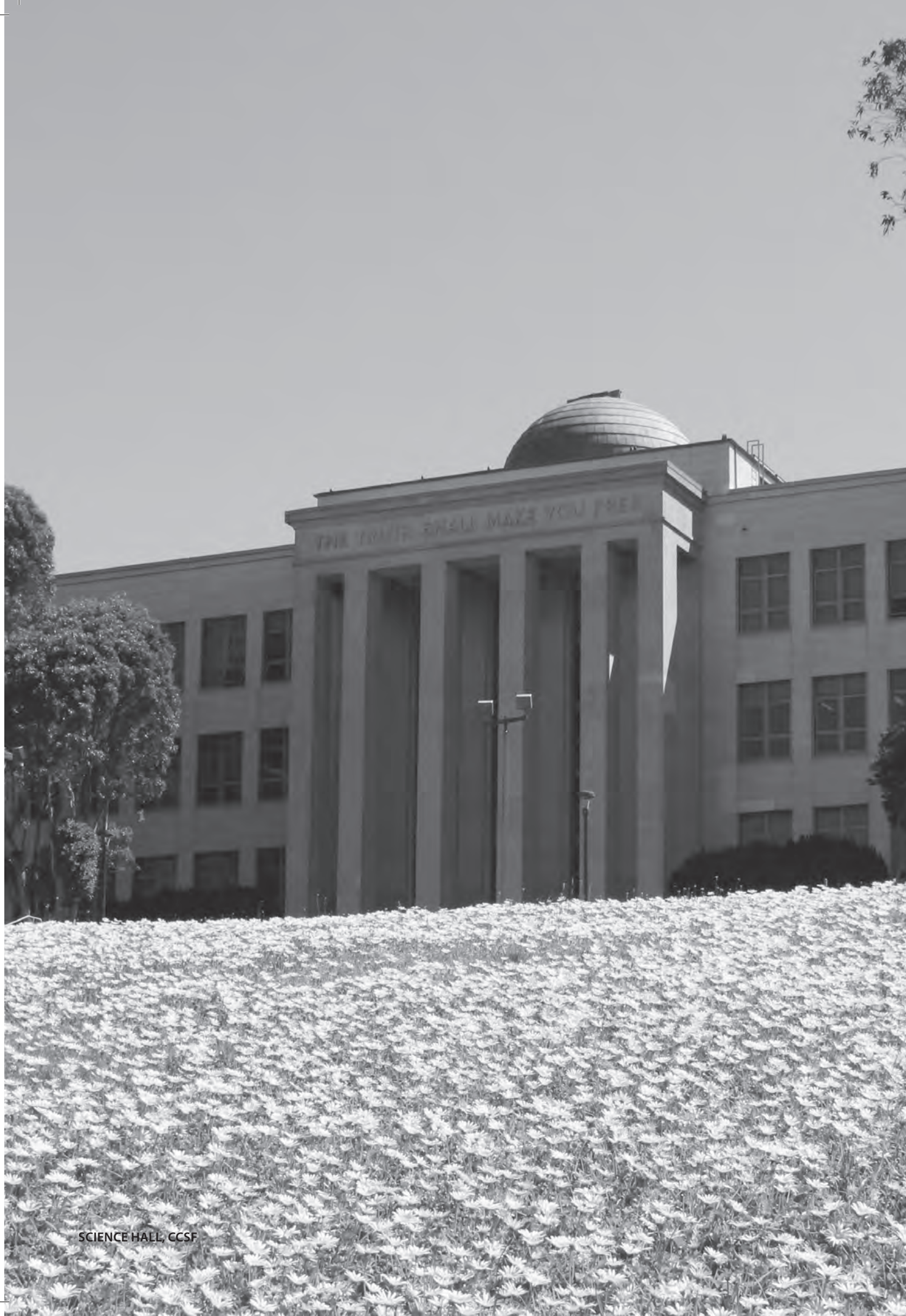
SCIENCE HALL, CCSF